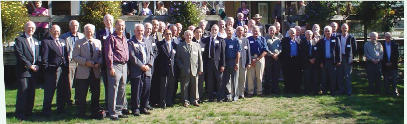
Above: BASc Class of '56 and guests lunch at the UBC Botanical Gardens' Reception Centre.

A vast majority of attending alumni had neither seen each other nor been back to campus since graduating. This provided a perfect opportunity to reconnect, share career and life stories, and meet faculty members.